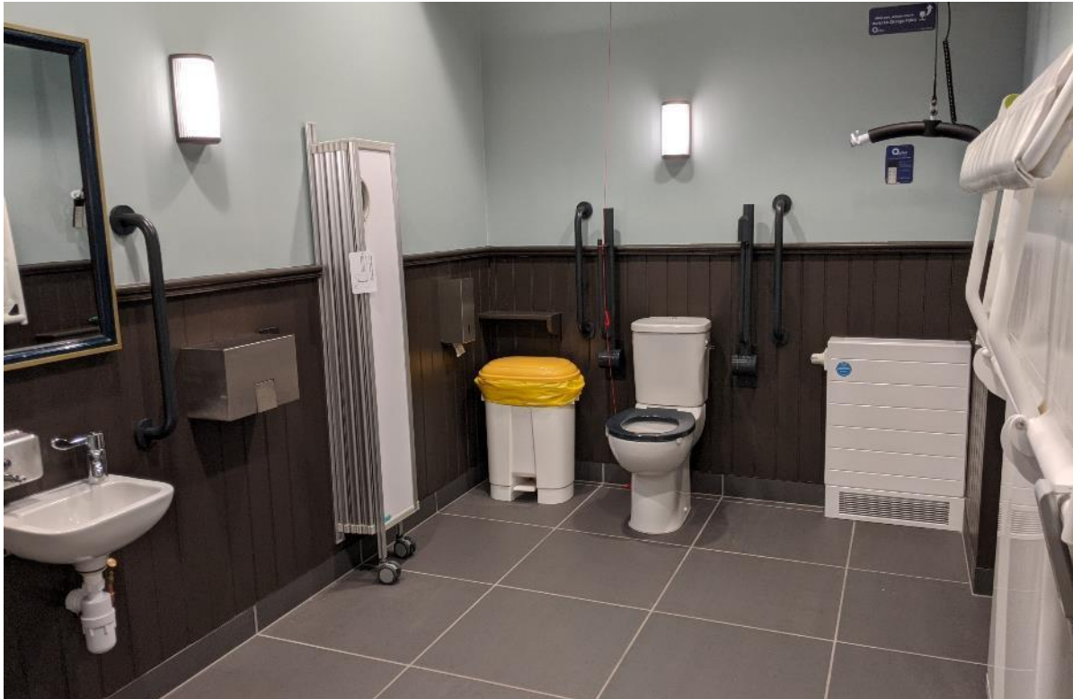
There are hand driers in the toilets, under the mirrors: