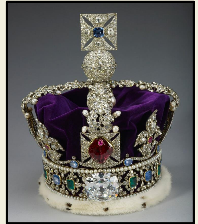
The Imperial State Crown