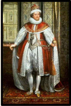
James VI & I