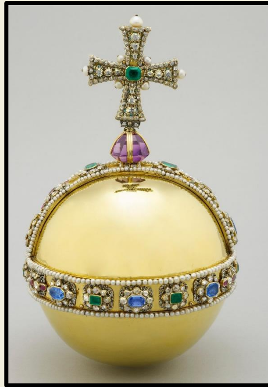
The Sovereign's Orb