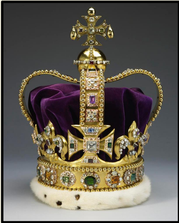
St Edward's Crown