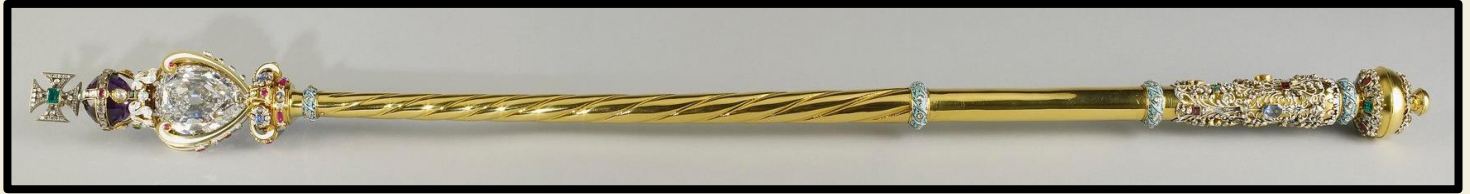
The Sovereign's Sceptre