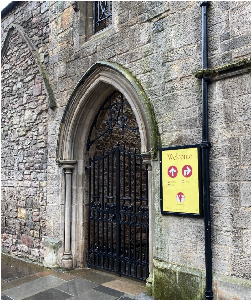
A ticket office is available through this entrance: