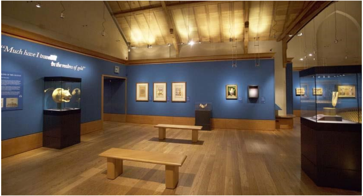
The exhibition is displayed in the main open space around the staircase bannister: